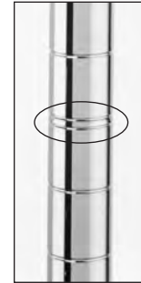
SiteSelect Posts feature double grooves every 8" (203mm) to aid assembly.