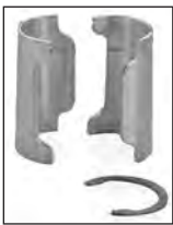
Aluminum Split Sleeve