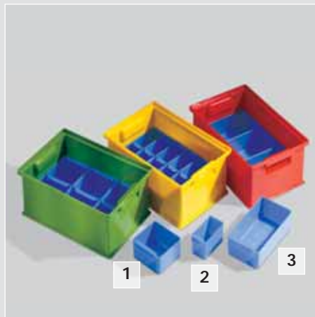
1 EK 030402 2 EK 030202