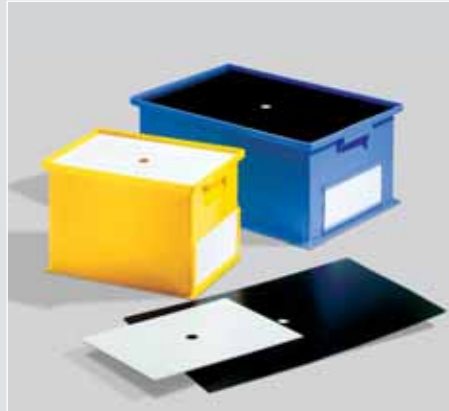
Lid with Finger Hole