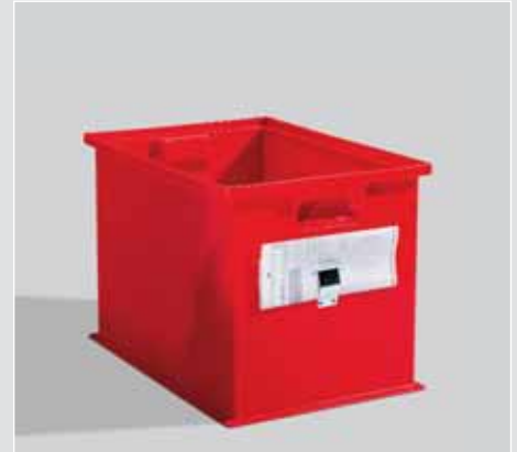
Clip to Hold Orders