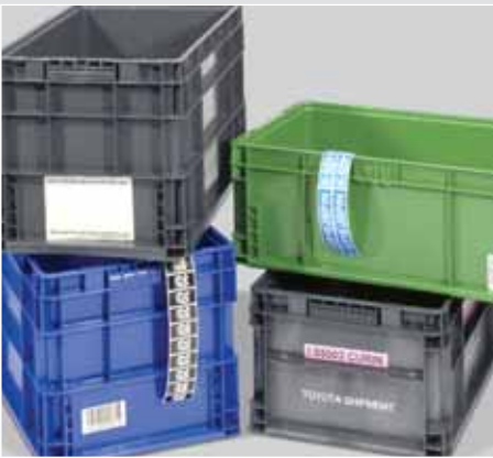
Sequentially Numbered Labels