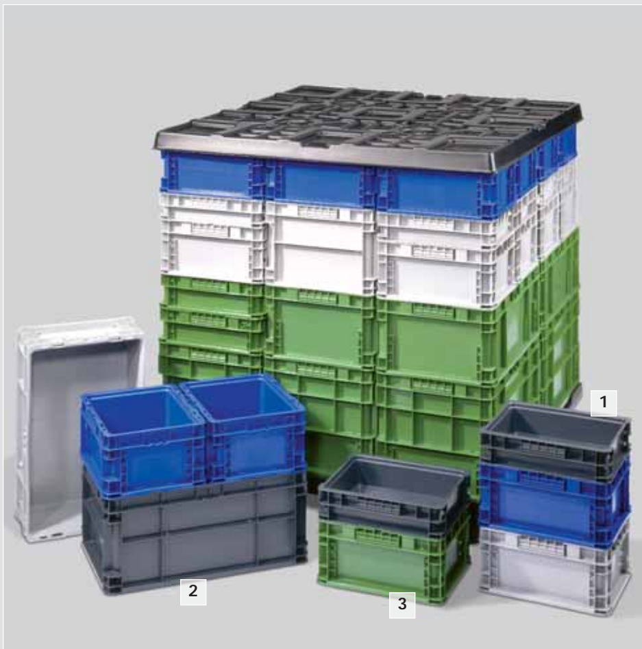
1 AF 121504.AC

The AF Transtac containers are the original industry standard and are perfect for heavy duty, demanding applications.