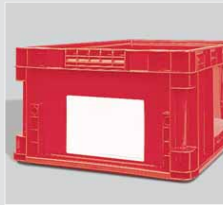
AF Placards, Ergonomic Handles