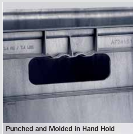
Punched and Molded in Hand Hold

Minimum order quantity for color match. Call your Packaging Specialist.