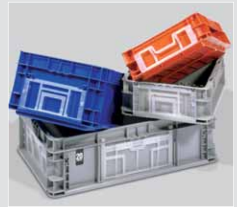
AF Card Holders