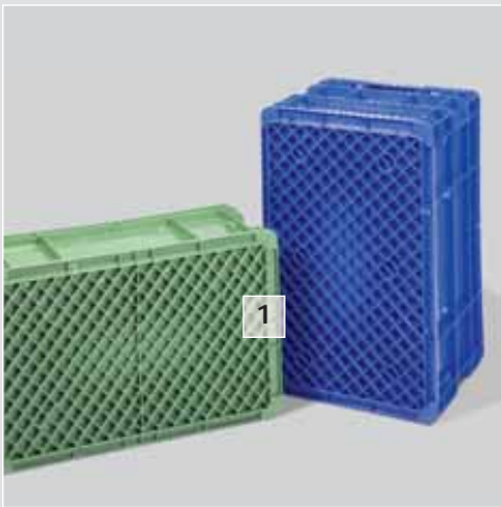
1 Reinforced Bottom