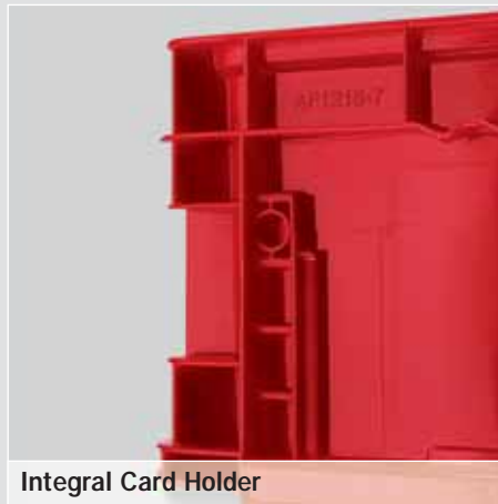
Integral Card Holder